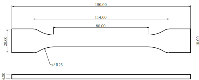
Tensile testing specimen; ASTM D638 (ISO 527, GB/T 1040)